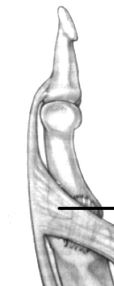
Adductor aponeurosis over the top of the ulnar collateral ligament

(sits below another strap, seen in diagram)