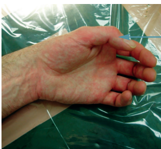
Tip of Thumb can't be straightened.